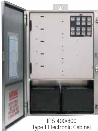
IPS 400/800 Type I Electronic Cabinet